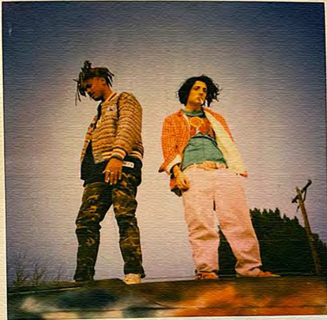
gold can last