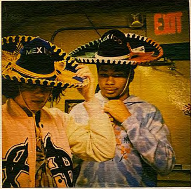
It is true that nothing