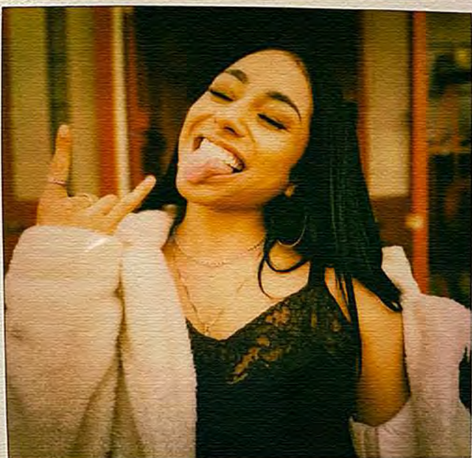
are torn apart