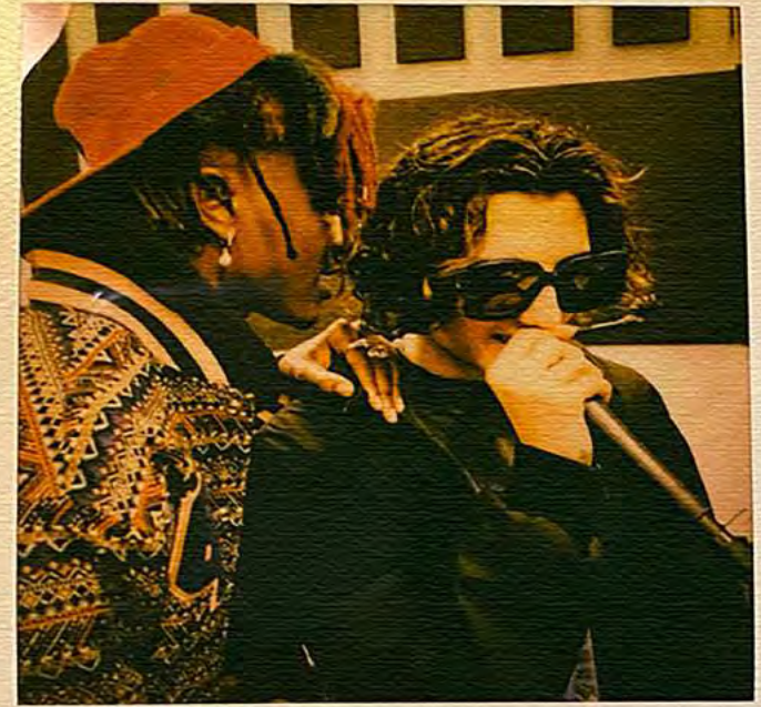
We will all