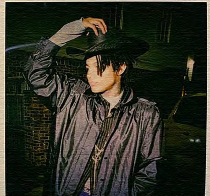
When the purest hearts